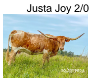
Justa Joy 2/0